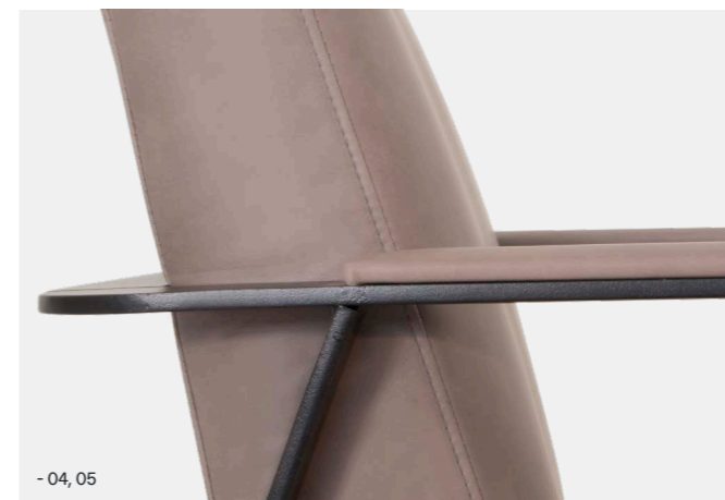
- 04, 05