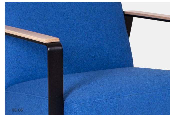
- 03, 05