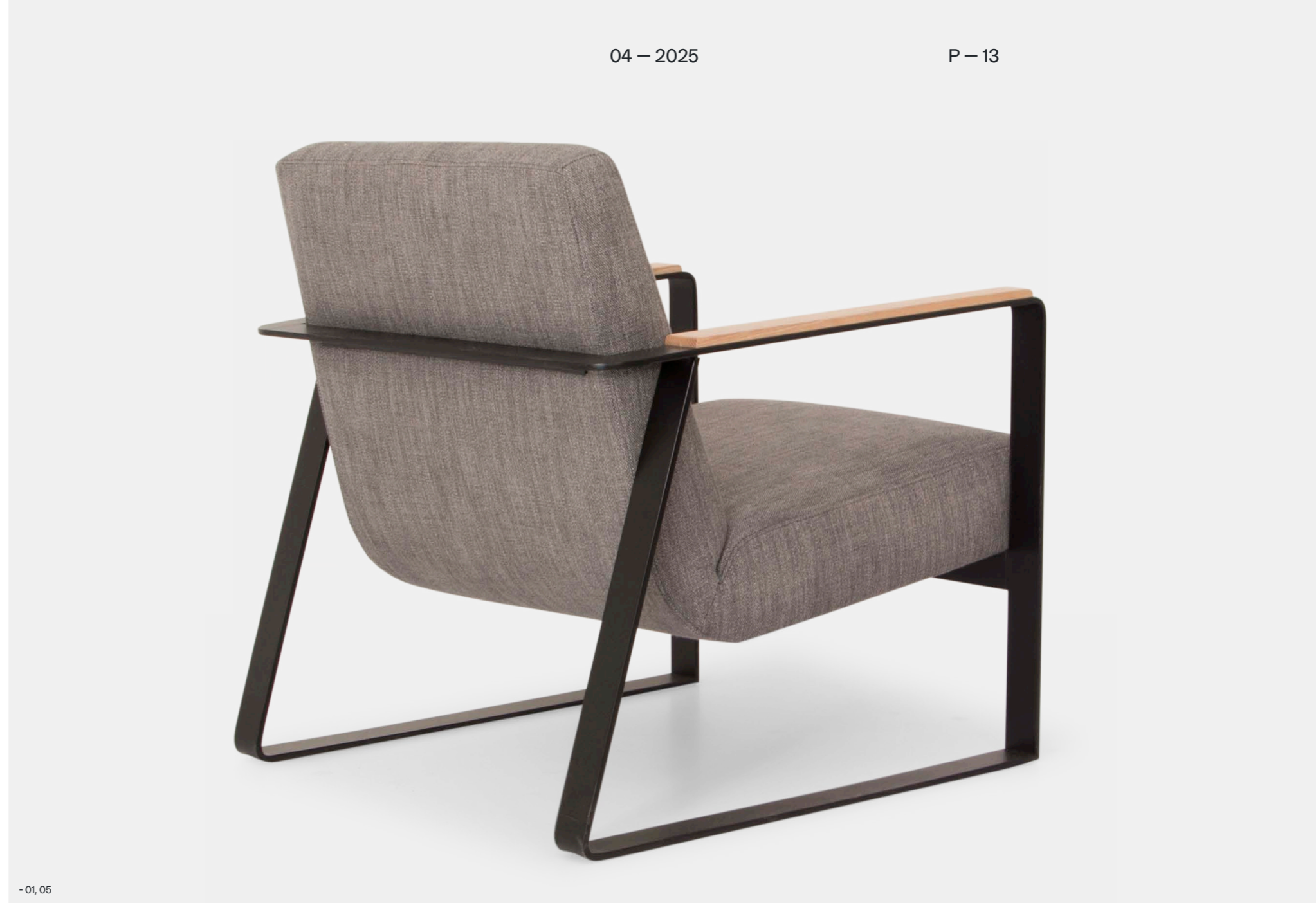
- 01, 05