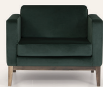
Lounge Chair 860W x 830D x 730H - Seat height 420mm

Generously proportioned option for comfortable lounge seating, with a seat height of 420mm.