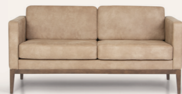
Studio 2-Seater 1400W x 750D x 760H - Seat height 450mm