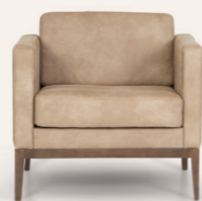
Studio Chair 760W x 750D x 760H - Seat height 450mm

With a more compact footprint and seat height of 450mm the Studio ideal for public spaces and waiting areas.