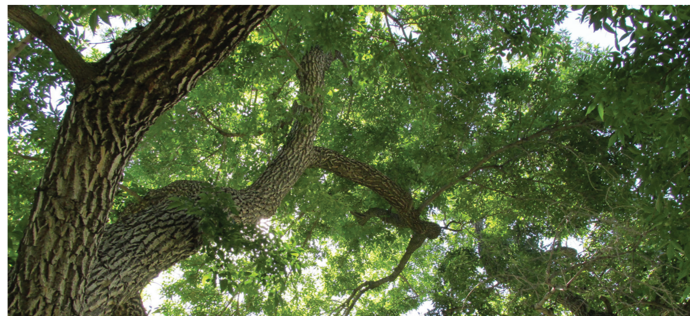
MADE FOR SOCIAL SPACES

The Adroit combines timeless silhouettes with modern manufacturing and high quality materials to create a collection that will endure.