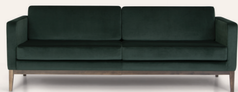
Lounge 3-Seater 2000W x 830D x 730H - Seat height 420mm