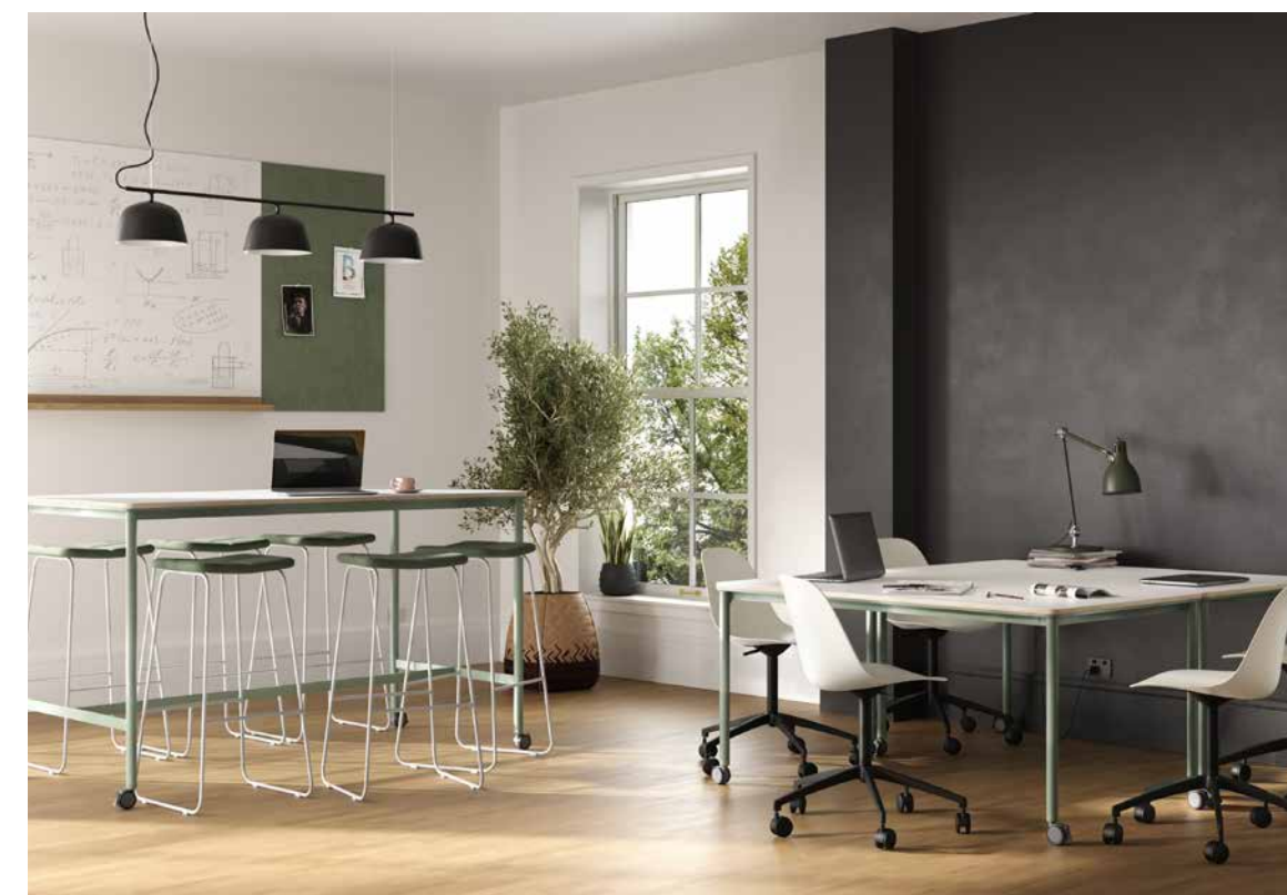
MADE FOR SOCIAL SPACES