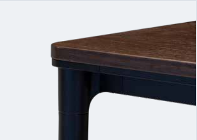
Ash Veneer Solid Ash veneer stained in colour of choice with ply edge.

Base available powder coated in any colour from the Dulux range.