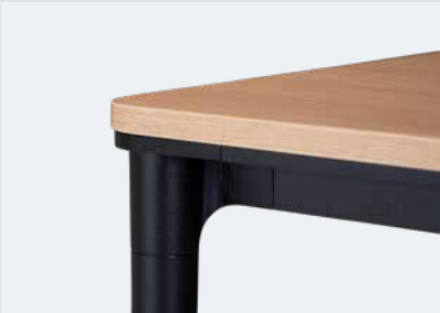
LPL Plain colour or wood-grain LPL with PVC edge tape.