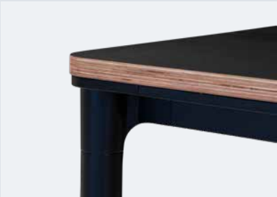
HPL Black or white HPL with exposed Birch ply edge.

Designed and manufactured in New Zealand by Harrows, the Mesa Collection is endlessly customizable with tops available in LPL, HPL over birch ply or Ash veneer stained in colour of choice.