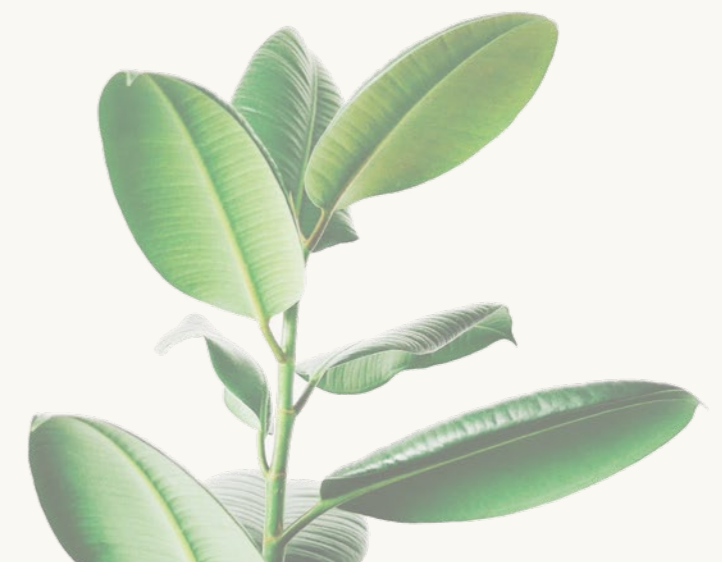
MADE FOR SOCIAL SPACES