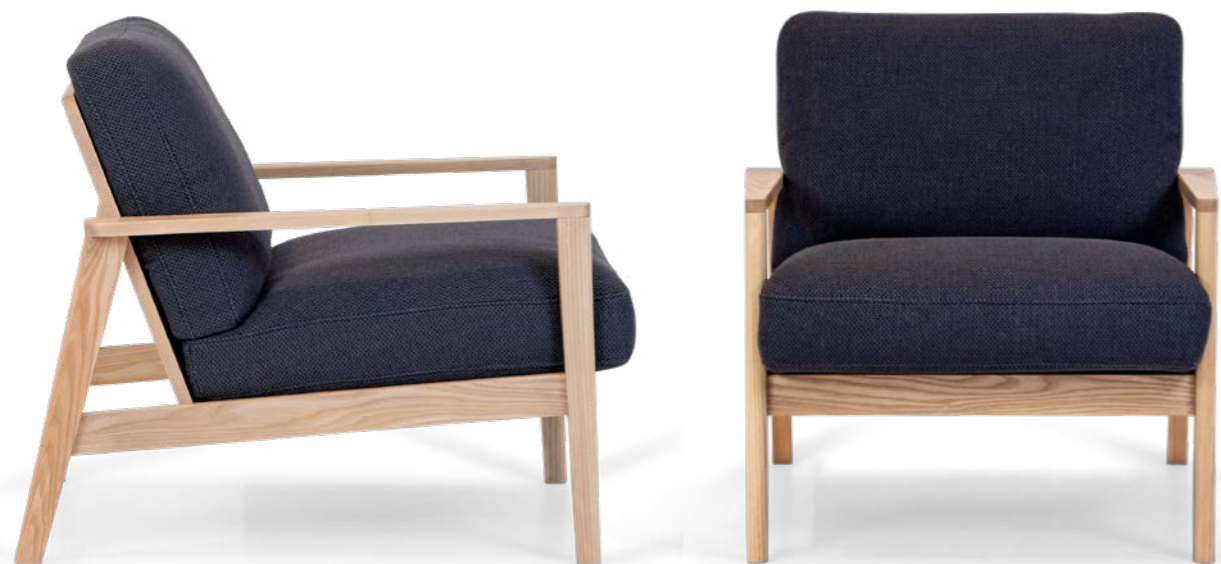
750h x 755w x 890d - Seat height 430h - Arms 530h