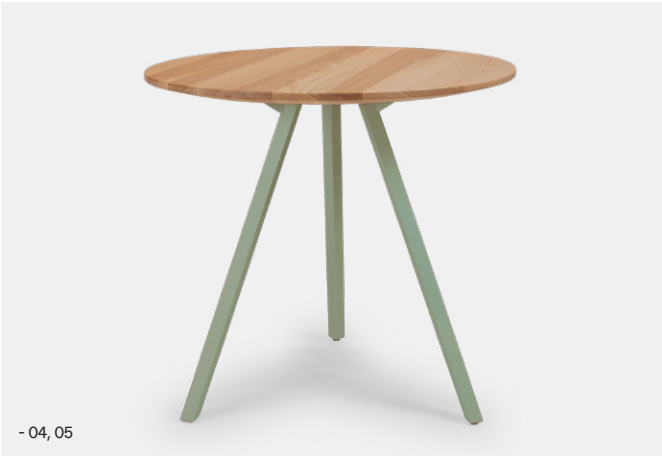
- 04, 05